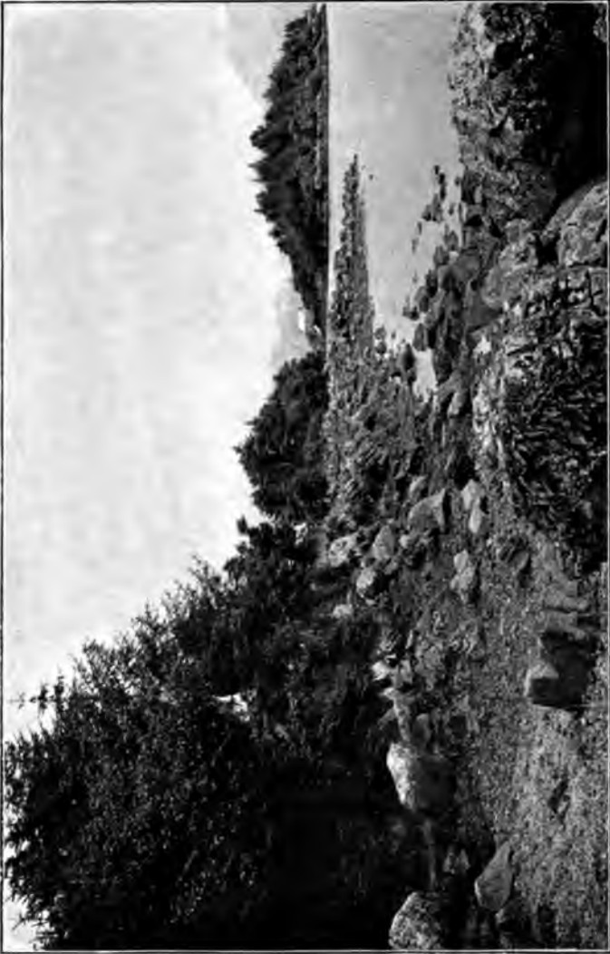
VEGETATION AT HIGH-TIDE LINE, SITKA HARBOR